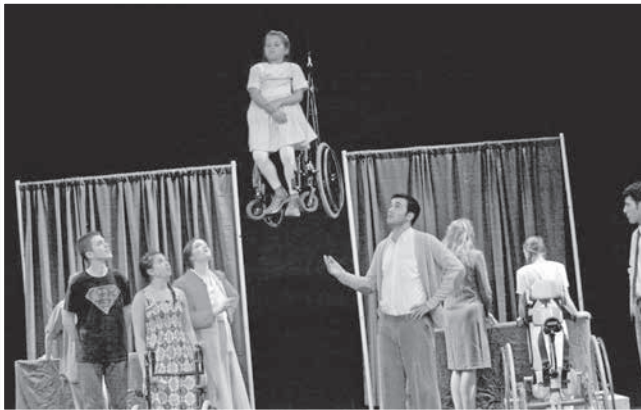
Actors were flying high above the stage floor in ANGEL-A Musical. Refreshments, displays & more were in the adjoining tent.