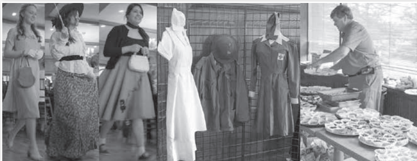
Fashions and desserts at the Vintage Tea and Fashion Show, 2015.