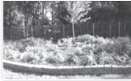
Before and After photos of landscaping done by PCI at the side and in rear of the COH grounds.